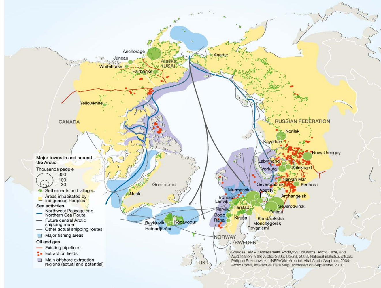
Towns and industrial activities in the Arctic